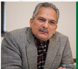
DR. BABURAM BHATTARAI Former Prime Minister of Nepal

Dr. Baburam Bhattarai is the former Prime Minister of Nepal and Chairperson of the Nepal Samajwadi Party. He served as prime minister from August 2011 to March 2013. Dr. Bhattarai was the Minister of Finance (2008) and played an instrumental role in the finalization of the new constitution (2015) as Chair of the Constitutional Political Dialogue and Consensus Committee.