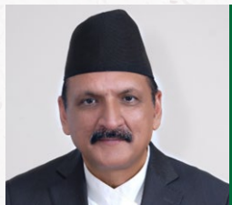
DR. PRAKASH SHARAN MAHAT Honorable Finance Minister of Nepal

Dr. Bhattarai received a bachelor's degree in architecture from Punjab University (1977) and a master's degree from School of Planning and Architecture, Delhi (1979). He completed his PhD in regional development planning from Jawaharlal Nehru University, New Delhi in 1986. His doctoral thesis was published in 2003 as The Nature of Underdevelopment and Regional Structure of Nepal: A Marxist Analysis . He has also contributed a number of books and articles published in English and Nepali. His areas of interest include development planning, inclusive and participatory democracy, and latest advances in science, technology and philosophy. As a visionary politician, he champions the need for radical transformation of Nepal's economy by enhancing production and stimulating economic growth alongside just distribution and sustainable green economy.